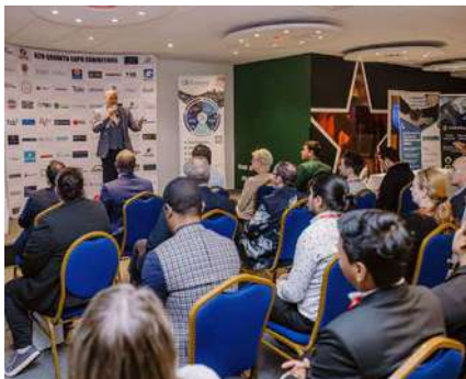
WORKSHOPS & SEMINARS

If your business is attracting new customers from advertising and word of mouth, it can be very tempting to write trade shows and business expos off as something that you don't need to do to attract new customers.