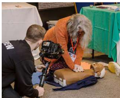
PRODUCT DEMOS & OFFERS